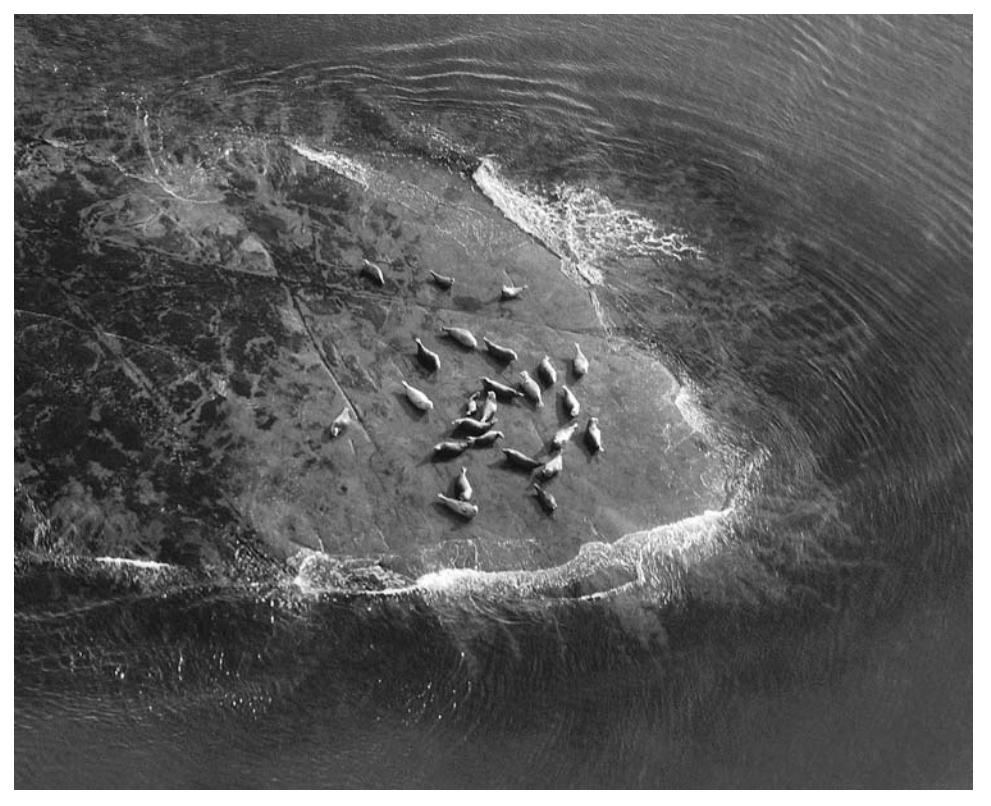
PLATE 1. Hauled-out harbor seals photographed during aerial surveys.

adjusted to conditions of the covariates that yield the maximum counts (we call these the optimum conditions). Observed counts are adjusted to optimum conditions because it is not possible to be at every site at low tide at noon every day of every annual survey period due to tidal fluctuations, weather, and logistics (Ver Hoef and Frost 2003). The optimum date for both quasi-Poisson and negative binomial regression was the earliest date, 18 August. However, the adjusted estimate of harbor seal abundance using a quasi-Poisson regression was 38 884 on 18 August, while using a negative binomial regression it was 80 609. Clearly, the choice of the regression method has a large impact on our abundance estimate.